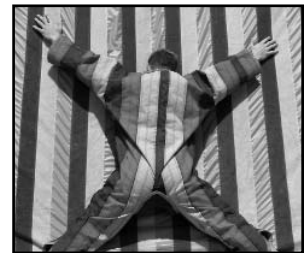
A student experiencing the "Human Sticky Wall"

On April 25, the housing staffs of Burnap, Crandall, Mead, and Winthrop halls and the Creating Awareness and Responsible Energy (C.A.R.E.) mixed fun and responsibility when they hosted "Easternpalooza." The festivities ran from noon until 6 p.m. on the Hurley Hall lawn. Students were seen on the "Human Sticky Wall" and the "Extreme Chaos Obstacle Course." Local bands provided entertainment. Eastern students competed to become Eastern Idol, a spin-off of the hit television show, American Idol. Students were given T-shirts to mark the event and won prizes including: TVs, DVD players, stereos, cameras and Eastern memorabilia. Food and drinks were provided throughout the day, compliments of Hurley Hall and Sodexo Food Services.